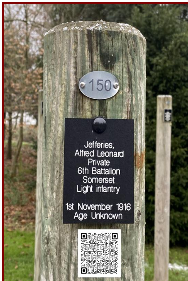
FIGURE 90: ALFRED LEONARD JEFFERIES NMA PLAQUE WITH QR CODE. 1644