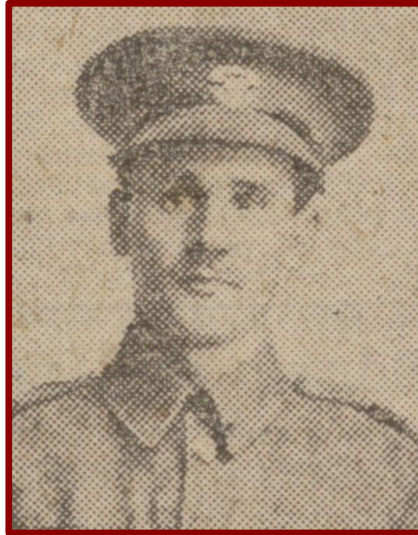
FIGURE 83: ALFRED LEONARD JEFFERIES. 1590

(30 th March 1886 – 01 st November 1916)