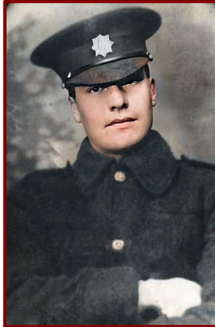
FIGURE 98: WILLIAM THOMAS HENRY PHILLIPS.